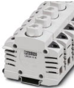
Fuse terminal blocks for NEOZED fuse inserts

Please be informed that the data shown in this PDF Document is generated from our Online Catalog. Please find the complete data in the user's documentation. Our General Terms of Use for Downloads are valid ( http://download.phoenixcontact.com )