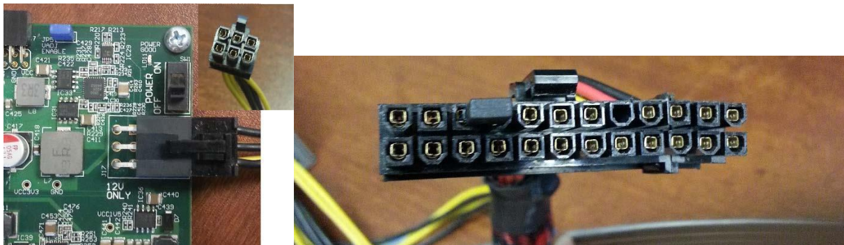
Figure1. Left: NetFPGA-1G can be powered by plugging the 6-pin PCIe power connector in J17; Right: Pin 16 and 17 are shorted using a jumper to power on a standard ATX power supply when used standalone.

The NetFPGA-1G can be powered using the 6-pin PCIe power supply connector (Fig. 1) of any standard ATX power supply. When installed on a PC motherboard, you can directly plug the 6-pin PCIe power supply connector of your PC power supply into J17. When used standalone (without a motherboard), you need to short pins 15 and 16 (pulling down PS_ON signal) of the main 20-pin connector of the standard ATX power supply to power-on the ATX unit (Fig.1).