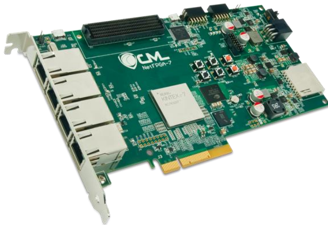
The NetFPGA-1G-CML board.

The NetFPGA-1G-CML is a versatile, low-cost network hardware development platform featuring a Xilinx® Kintex®-7 XC7K325T FPGA and includes four Ethernet interfaces capable of negotiating up to 1 GB/s connections. 512 MB of 800 MHz DDR3 can support high-throughput packet buffering while 4.5 MB of QDRII+ can maintain low-latency access to high demand data, like routing tables. Rapid boot configuration is supported by a 128 MB BPI Flash, which is also available for non-volatile storage applications. The standard PCIe form factor supports high speed x4 Gen 2 interfacing. The FMC carrier connector provides a convenient expansion interface for extending card functionality via Select I/O and GTX serial interfaces. The FMC connector can support SATA-II data rates for network storage applications. The FMC connector can also be used to extend functionality via a wide variety of other cards designed for communication, measurement, and control.