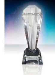
Elektra Award 2010