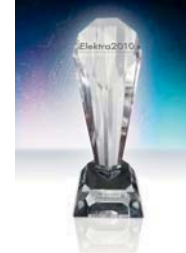
Elektra Award 2010