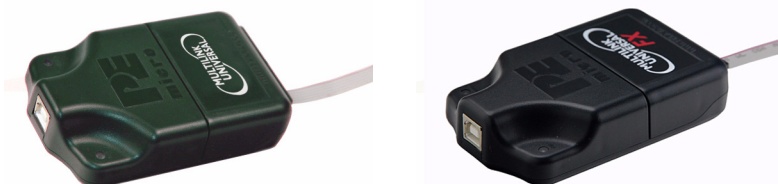
Figure 8-1: Multilink Universal (left) & Multilink Universal FX (right)