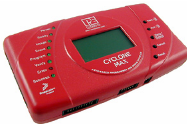
Figure 8-2: P&E's Cyclone MAX