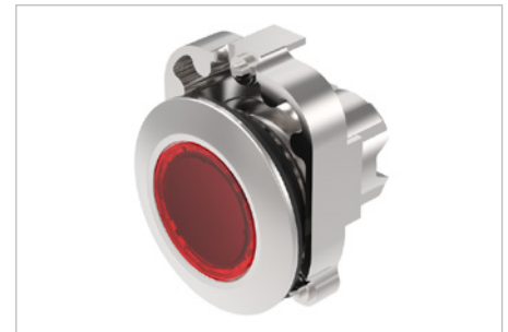
Product can differ from the current configuration.