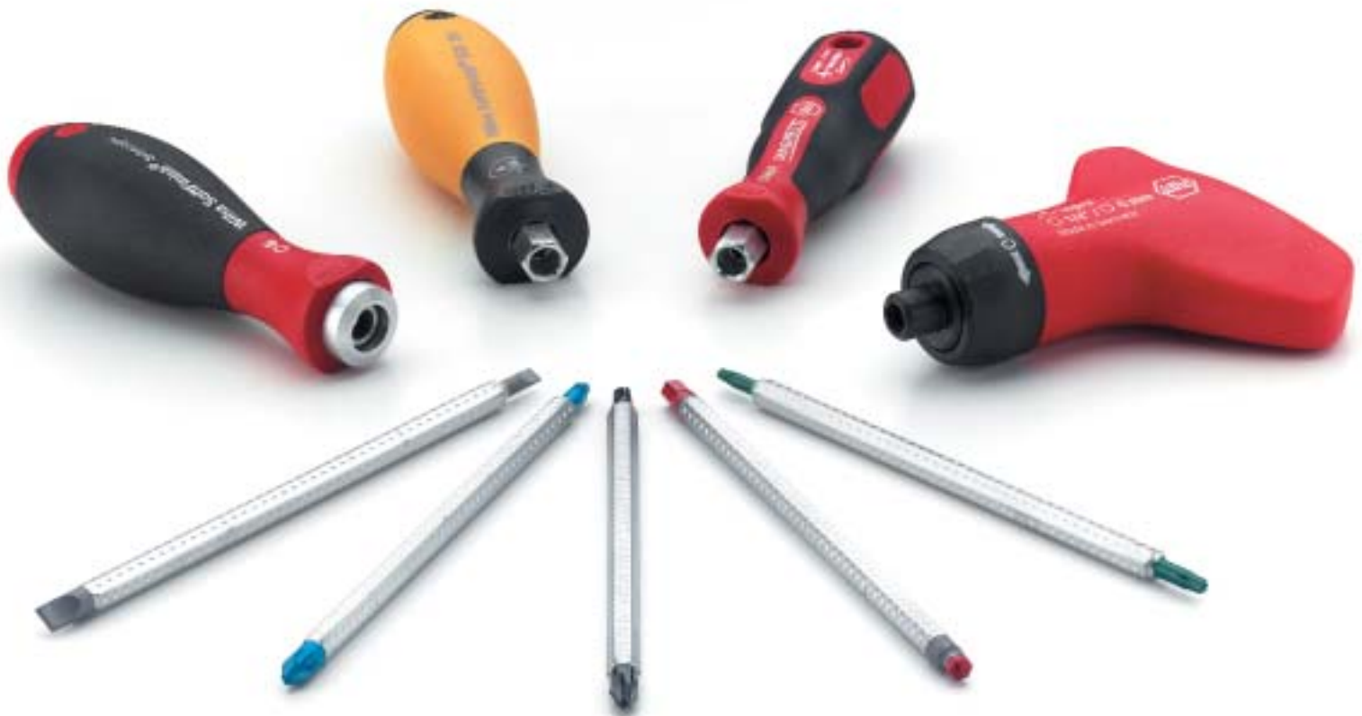
Colour-coded ChromTop® tips for maximum clarity.

Are you looking for a versatile and compact tool system for your tool-case or for on the road?