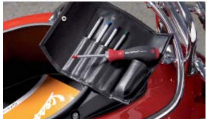
The Wiha SYSTEM 6 range is the compact allrounder for different applications.

The Wiha SYSTEM 6 system provides the right tool for every application – ideal for industry, trade and the ambitious handy man.