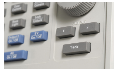
Figure 3. Simplifies Output 1 and Output 2 setup with tracking feature