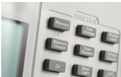
Figure 1. Output sequencing made easy with intuitive keypads

Both models of the U8030 series come with a set of features to suit your needs while remaining easy to use. The LCD screen displays both voltage and current readings in a one-view panel while the all ON/OFF button allows multiple outputs to be controlled simultaneously. Additionally, the auto-track feature simplifies setup between output 1 and output 2. With these, you get a solid bench power supply plus a set of convenient and easy to use features.