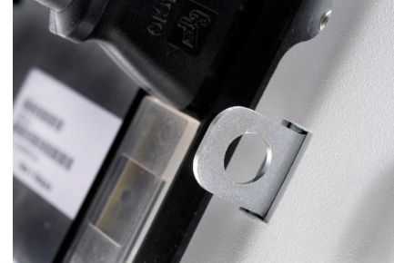
Physical lock mechanism as illustrated

Essential security features: Over-voltage protection (OVP)/ Over-current protection (OCP), keypad lock and physical lock mechanism