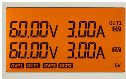
Figure 2. Backlight on/off feature with dual reading (voltage and current) on an LCD display