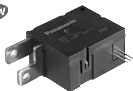
Vertical terminal type