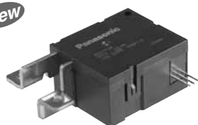
Horizontal terminal type