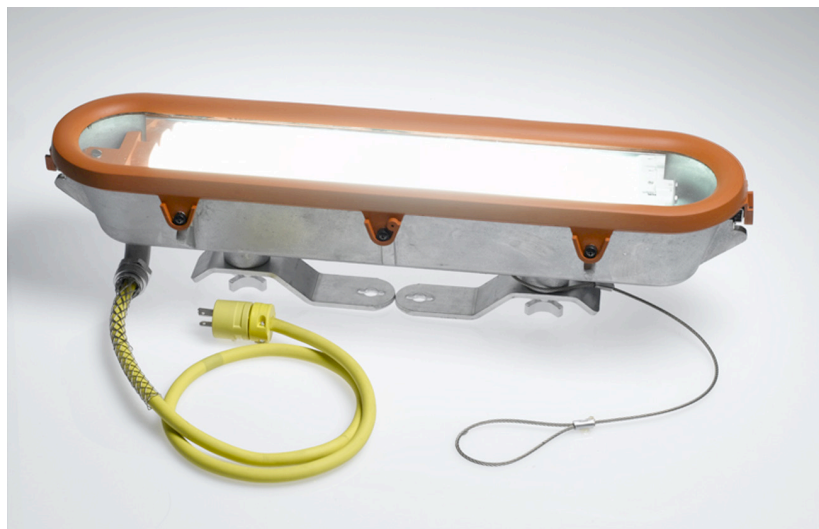
Wide-Area Fluorescent Light For Class I, Division 2 and Zone 2 Applications

For additional product information, please visit: http://www.molex.com/link/widearea.html and http://www.woodhead.com .