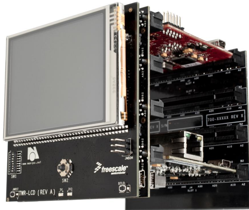
Figure 2 - Tower System with TWR-LCD