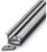
DIN rail, deep drawn, high profile, unperforated, 1.5 mm thick, material: aluminum, height 15 mm, width 35 mm, length 2000 mm

DIN rail, unperforated - NS 35/15 AL UNPERF 2000MM - 1201756