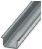
DIN rail, material: Galvanized, unperforated, height 15 mm, width 35 mm, length: 2 m

DIN rail - NS 35/15 ZN UNPERF 2000MM - 1206586