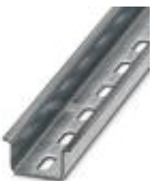
DIN rail, material: Galvanized, perforated, height 15 mm, width 35 mm, length: 2 m

DIN rail - NS 35/15 ZN PERF 2000MM - 1206599