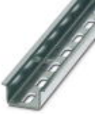
DIN rail 35 mm (NS 35)

DIN rail - NS 35/15 WH PERF 2000MM - 0806602