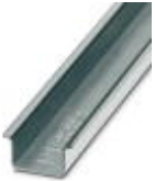
DIN rail 35 mm (NS 35)

DIN rail - NS 35/15 WH UNPERF 2000MM - 1204135