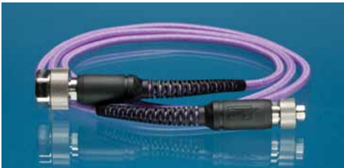
TABLE 4: HIGH THROUGHPUT PRODUCTION TEST ASSEMBLY SPECIFICATIONS 1

Gore high throughput production test assemblies are engineered specifically to reduce total testing costs in production test environments. Their stable performance ensures precise and repeatable measurements, reducing the risk of testing errors and the need for time-consuming troubleshooting and system calibration. These test assemblies increase throughput on the manufacturing line by eliminating the need to use a torque wrench.