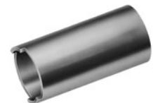
AT112 Socket Wrench