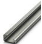
G-profile DIN rail, material: Steel, unperforated, height 15 mm, width 32 mm, length 2 m

DIN rail - NS 32 UNPERF 2000MM - 1201015