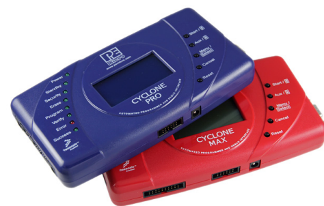
Cyclone PRO & Cyclone MAX

The USB Multilink Universal and Universal FX are intended for development and are not designed to accommodate the demands of production programming. However, P&E's Cyclone programmers are specifically engineered to withstand the rigors of a production environment and will provide a seamless transition from the Multilink. More information is available online at pemicro.com/cyclonepro and pemicro.com/cyclonemax .