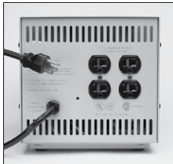
60 Hz, 70 – 1000 VA, (4) 5-15R Receptacles