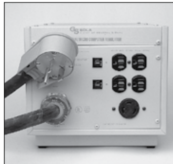
60 Hz, 2000–3000 VA, (4) 5-15R and (1) L5-30P Receptacle