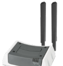
LTE Connectivity Kit