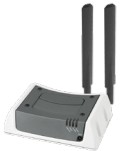
LTE Connectivity Kit