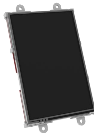
The uLCD-35DT Display Module