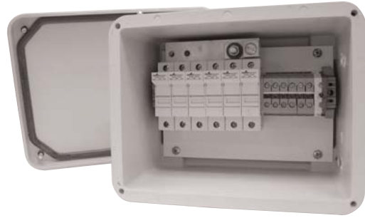
BCBC Series Compact Box