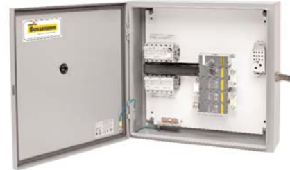
BCBD Series Integrated Disconnect Box