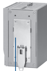
Din-rail kit ▲ Rear view