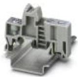
End clamp, for assembly on NS 32 or NS 35/7.5 DIN rail