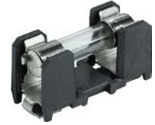
OGN-SMD equipped with fuse

500 VAC · 4 W/16 A (VDE) · 500 V · 16 A (UL/CSA)