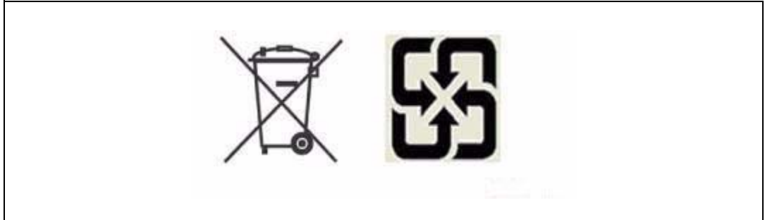
Figure 13. Recycling symbols

This product contains a non-rechargeable lithium (lithium carbon monofluoride chemistry) button cell battery fully encapsulated in the final product.