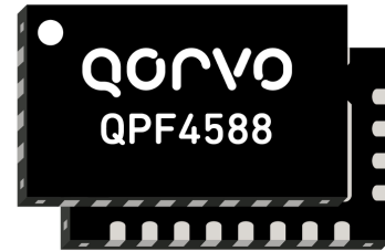
24 Pin 5x3 mm QFN Package