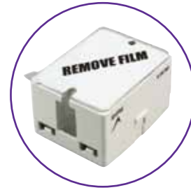
Optional Thermal Pad (SSR-TP-1) Section 3 p.21

We at Magnecraft strive to be your one-stop-shop for all of your solid state relay needs. The new line of 6 series solid-state relays give industrial relay users an energy-efficient current switching alternative. Depending on the application, these solid-state relays offer a number of advantages over electromechanical relays, including longer life cycles, less energy consumption and reduced maintenance costs. This is why great care and attention was given when developing the next generation of “Hockey Puck” style SSRs. These new SSRs will be finger-safe , fit a pre-cut heat transfer thermal pad (sold separately) and have the ability to be mounted onto a factory tested pre-drilled and tapped heat sink (sold separately).