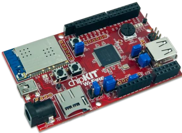
The chipKIT Wi-FIRE board.