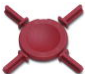
Coding star, Length: 3 mm, Width: 3 mm, Height: 6 mm, Color: red

Zack marker strip - ZB 8:UNBEDRUCKT - 1052002