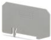
Partition plate, Length: 75 mm, Width: 2 mm, Height: 49 mm, Color: gray