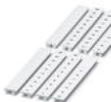
Zack marker strip, Can be ordered: Strip, white, Labeled according to customer specifications, Mounting type: Snap into tall marker groove, For terminal block width: 8.2 mm, Lettering field: 10.5 x 8.15 mm

Marker for terminal blocks - UC-TM 8 - 0818072