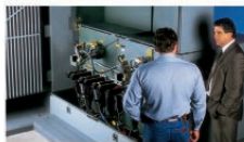
COOPER Power Systems