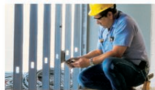
COOPER Wiring Devices