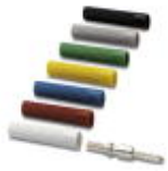
Insulating sleeve, Color: blue