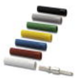
Insulating sleeve, Color: green