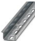
DIN rail, material: Galvanized, perforated, height 15 mm, width 35 mm, length: 2 m

DIN rail - NS 35/15 ZN PERF 2000MM - 1206599