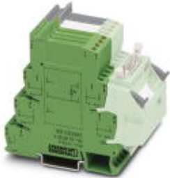
VARIOFACE feed-through terminal block (2-wire connection), for PLC-RELAY universal series, with light indicator 24 V DC

Please be informed that the data shown in this PDF Document is generated from our Online Catalog. Please find the complete data in the user's documentation. Our General Terms of Use for Downloads are valid ( http://phoenixcontact.com/download )