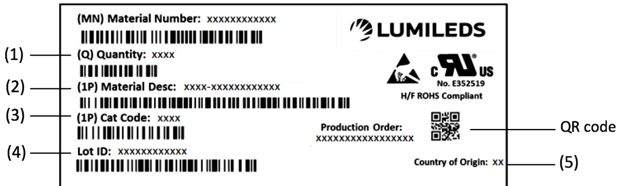
Figure 13a: Example of reel label format A.