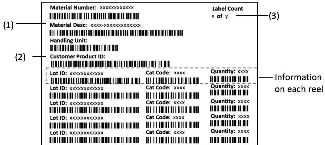
Figure 17a. Example of shipment box label format A.

Notes for Figure 16: 1. Drawings are not to scale.