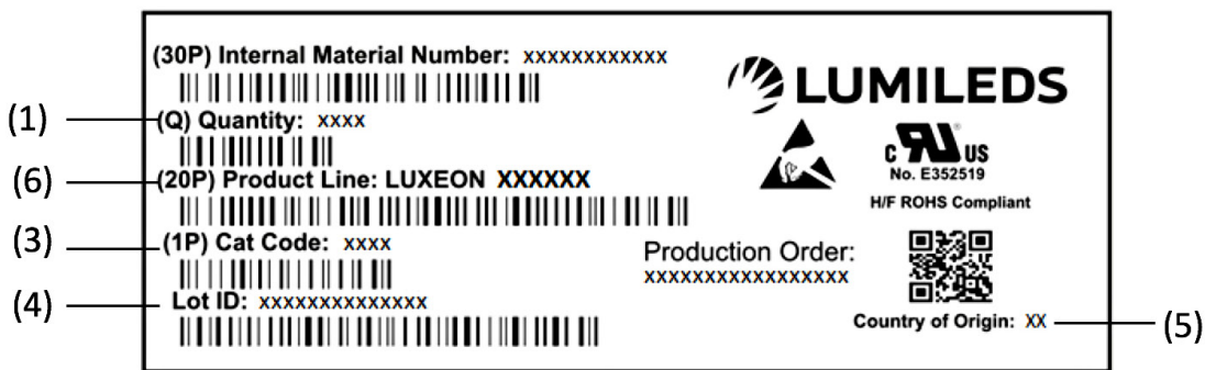
Figure 13b. Example of reel label format B.