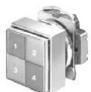
110–120 V, 50–60 Hz Transformer