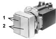
110–120 V, 50–60 Hz. Transformer