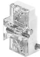
Push-on Push-off Module 9001K85

Reference K85 This module can be added to standard 9001K, 9001KX, 9001SK or 9001T momentary push button operators. Contact blocks mounted behind this module (maximum of 2) are held in the depressed position when the operator is pressed once, and released to their normal position when the operator is pressed again. For a N.C. circuit, use a 9001KA3 or the N.C. contact of either a 9001KA1 or 9001KA4. For a N.O. circuit, use the N.O. contact of either a 9001KA4 or 9001KA6.