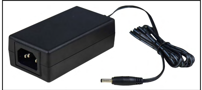
Figure 3. Universal power adapter included with the 19243 Mini Monitor

NOTE: The power cord must be purchased separately if ordering the 19243 Mini Monitor. The power cords are available as the following item numbers: