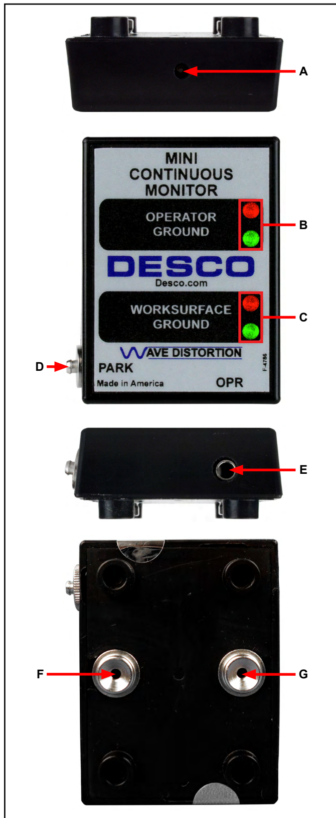
Figure 4. Mini Monitor features and components

A. Power Jack: Connect the included 24VDC power adapter here.