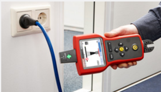
Non-contact voltage (NCV) detection.

When used with the AT-7000-TE Transmitter, the Tip Sensor pinpoints the location of energized and de-energized wires in tight, hard to reach spaces. It easily and accurately traces the targeted energized and de-energized wires in junction boxes, corners, walls, floors and ceilings to a depth of up to 6.1 meters (20 feet).