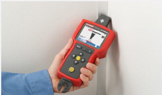
Use the Tip Sensor to trace wires in hard to reach areas.

The SC-7000-EUR signal clamp accessory can be used with the AT-7000-TE Transmitter to induce a signal into energized and de-energized wires when there is no access to bare conductors. Simply clamp around the desired wire to induce the signal, then begin tracing.