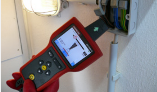
Trace energized or de-energized wires by removing the junction box cover.