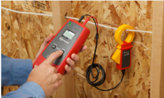
Induce signal with the signal clamp when there is no bare conductor.

Trace energized and de-energized wires enclosed in metal conduit by removing the junction box cover and using the AT-7000-RE Receiver's Tip Sensor to identify the specific wire carrying the transmitted signal generated by the AT-7000-TE Transmitter. Wires in non-metal conduit can be traced directly without opening the junction box and using the AT-7000-RE Receiver's Smart Sensor™.