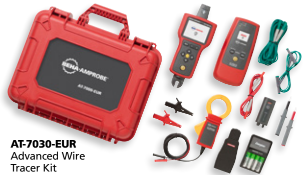
AT-7030-EUR Advanced Wire Tracer Kit