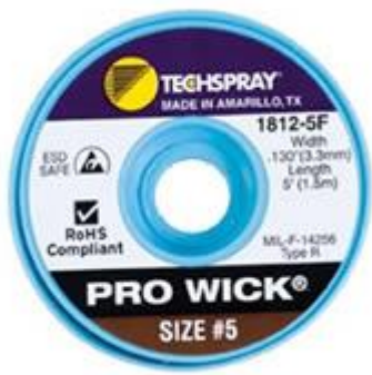
1812-5F Pro Wick Brown #5 Braid - AS 5' 25 units/case