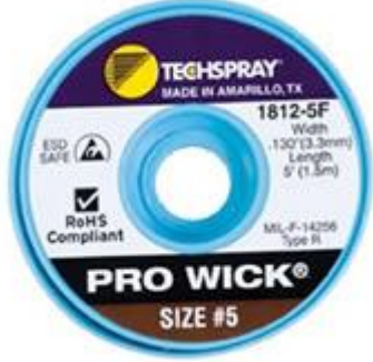
1812-5F Pro Wick Brown #5 Braid - AS 5' 25 units/case