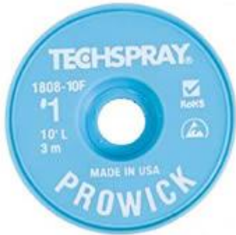
1809-10F Pro Wick Yellow #2 Braid - AS 10' 25 units/case