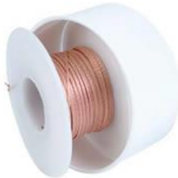
1809-25F Pro Wick Yellow #2 Braid - AS 25' 1 units/case