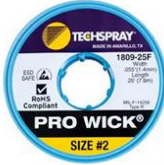
1810-25F Pro Wick Green #3 Braid - AS 25' 1 units/case