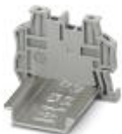
Quick mounting end clamp for NS 35/7,5 DIN rail or NS 35/15 DIN rail, can be fitted with ZB 5 and ZBF 5 zack marker strip, KLM 2, KLM3, and KML3L terminal strip marker, parking option for FBS...5, FBS...6, KSS 5, KSS 6, width: 5.15 mm, color: gray