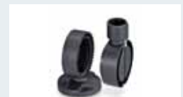
Order No. 2700151 Foldaway base, pitch 7.5°