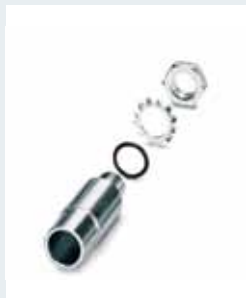
Order No. 2700150 Adapter for single-hole mounting