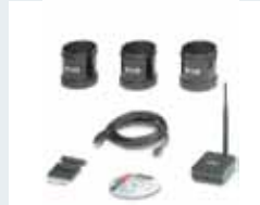
Order No. 2700679 WIN wireless system