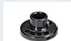
Order No. 2700164 Base for tube, Ø 25 mm, metal