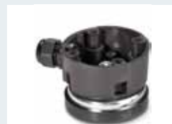
Order No. 2700155 Outlet box with magnetic base and lateral cable entry