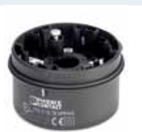
Order No. 2700092 Connection element with spring-cage connection