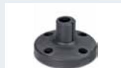
Order No. 2700163 Base for tube, Ø 25 mm, plastic