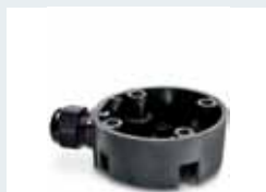
Order No. 2700153 Outlet box with lateral cable entry