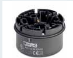
Order No. 2700093 Connection element with screw connection