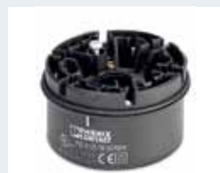
Order No. 2700095 Connection element with screw connection