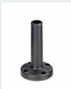
Order No. 2700156 Base with integrated tube, 110 mm long

250 mm Order No. 2700157 400 mm Order No. 2700158 1000 mm Order No. 2700154 Tube, Ø 25 mm