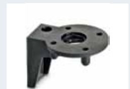
Order No. 2700143 Bracket for base mounting