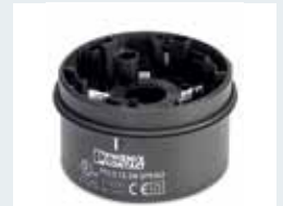
Order No. 2700091 Connection element with spring-cage connection