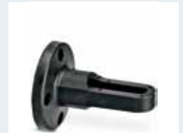
Order No. 2700161 Bracket for two-sided surface mounting