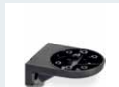
Order No. 2700149 Bracket for base mounting with hidden cable routing