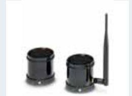
Order No. 2700683 Wireless multiplexer