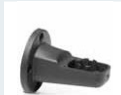
Order No. 2700160 Bracket for single-sided surface mounting