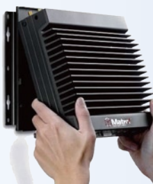
1. Ready-to-deploy wall mount kit