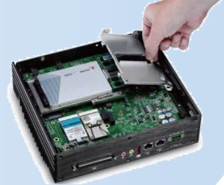
3. Flexible memory expansion slots