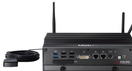
MXE-5300 with Antenna