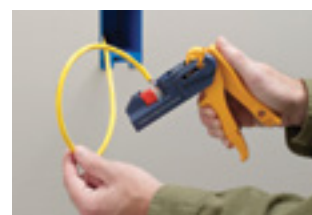
3. Insert jack in JackRapid front first with IDC slots facing blades of JackRapid.