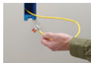
2. Determine wiring scheme. Dress all four pairs (eight wires).