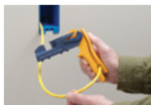
1. Strip cable jacket with a standard cable stripper or the built-in cable stripper.

Get accurate terminations and clean, consistent cuts every time with the JackRapid Termination Tool.