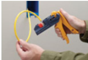
3. Insert jack in JackRapid front first with IDC slots facing blades of JackRapid.