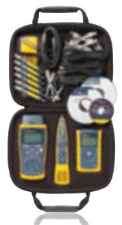
CableIQ Gigabit Service Kit