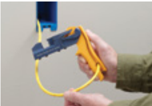
1. Strip cable jacket with a standard cable stripper or the built-in cable stripper.

Get accurate terminations and clean, consistent cuts every time with the JackRapid Termination Tool.