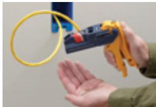
6. Wires will be seated and cut for a solid termination.