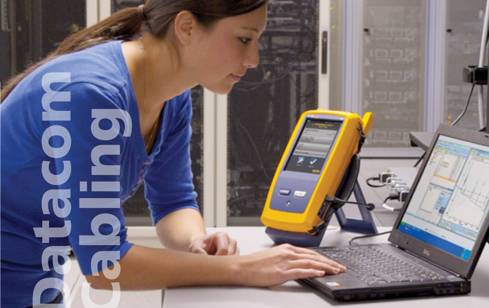
OneTouch™ AT Network Assistant