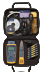
CableIQ Advanced IT Kit

To learn more visit: www.flukenetworks.com/cableiq