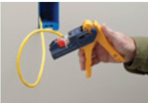
4. Ensure jack is completely and securely inserted in jack holder bed with IDC slots facing the blades.