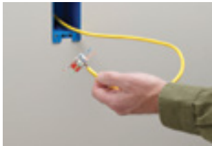
2. Determine wiring scheme. Dress all four pairs (eight wires).