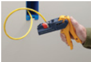
5. Pull trigger completely and remove excess wire prior to releasing trigger.