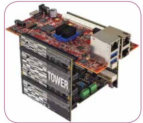
Figure 1. TWR-LS1021A module (TWR-LS1021A, TWR-SER-IO and TWR-ELEV)