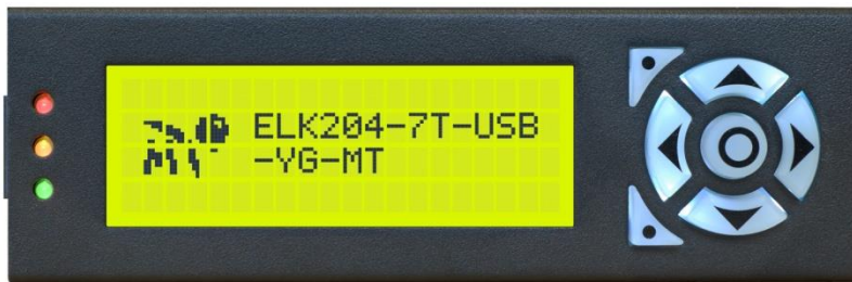
Figure 1: ELK204-7T-1U-MT

The versatile Enclosure Series, with all the features mentioned above, is available in a variety of colour and material options to suit almost any application.