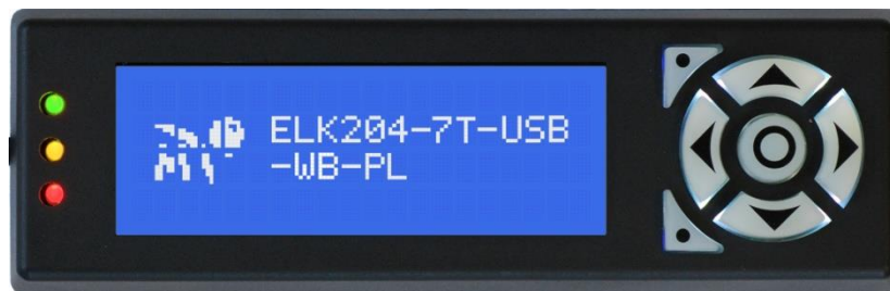
Figure 2: ELK204-7T-1U-PL