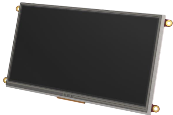
The uLCD-70DT Display Module

NOTE (*): Arduino remains the property of the Arduino Team. All references to the word Arduino and Arduino Hardware are licensed under the Creative Commons Attribution Share-Alike license.